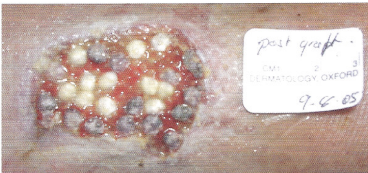
Figure 3 The ulcer showing good punch graft take