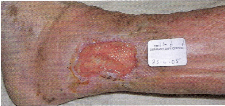
Figure 1 Mr R's leg ulcer before treatment showing a pale wound bed with some slough present